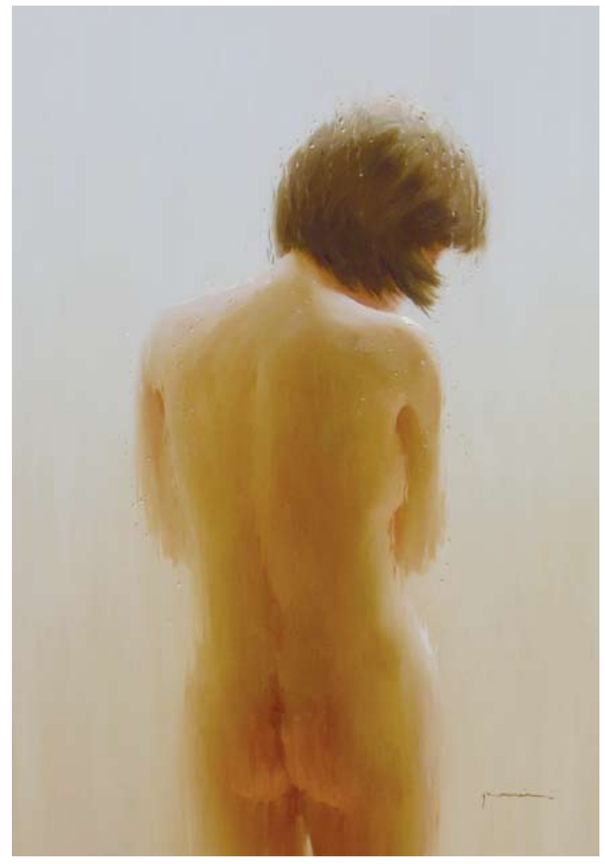
Evening Shower, Michael Mao. Oil on canvas.