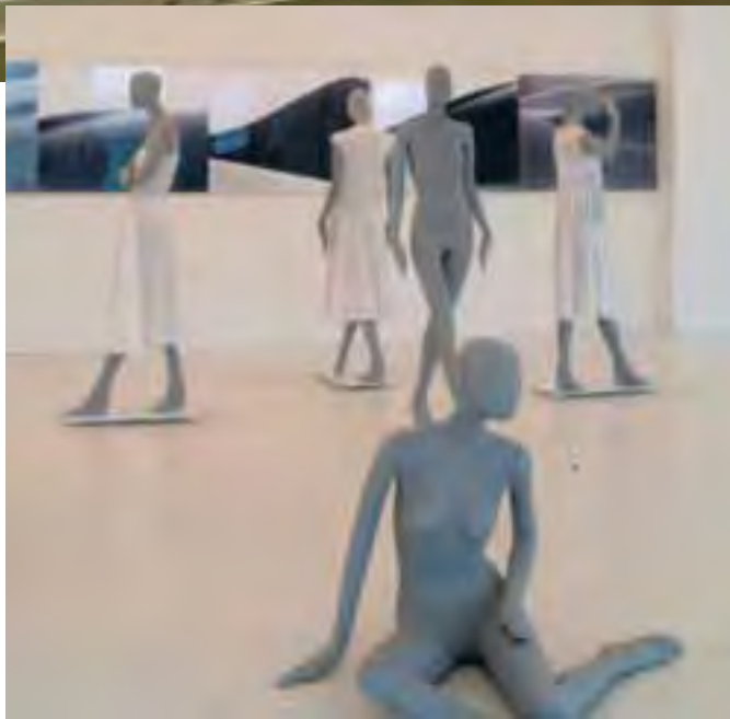
Top: The front doors of Pucci's Pacific Design Center showroom. Photo by Steven Barston. Right: The showroom during its Jens Risom – Furniture show. Image courtesy Ralph Pucci International. Above: Figures from Pucci's Manikin series. Image courtesy Ralph Pucci International.

For a verification of his philosophy, look no farther than the bare-bones modernist space Pucci has created at the Pacific Design Center, which first opened its doors March 1st. "We stripped the space and painted the floor, ceiling and walls white," the designer recounts. "Where some designers may carry 500 pieces in a space this size, we display 150 pieces and let the product speak for itself."