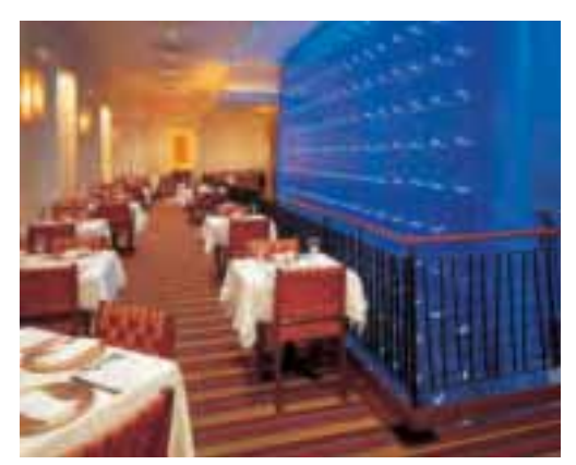
May 2: Rosa Mexicano.

cream sauce. It's easily the best steak this side of the Rio Grande. 61 Columbus Avenue at 62nd Street, New York. Reservations: 212.977.7700. SHOW: Catch the one-time-only Manhattan showing of the L.A. Philharmonic and Bill Viola's Tristan and Isolde Project at Lincoln Center's Avery Fisher Hall . Viola's visuals are engaging, no matter which coast you're on. Avery Fisher Hall, 10 Lincoln Center Plaza, New York. Tickets: 212.721.6500.