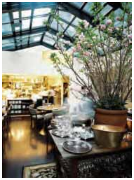
April 21: BLT Fish.