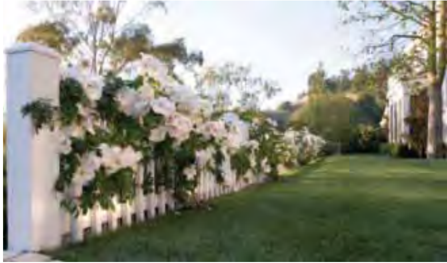
Above and Right: For a horticultural remodel of this home in Beverly Hills, Block used English boxwoods to add greenery and accentuate the architecture; delicate flowers and burgundy foliage complete the design.

Giverny. Hampton Court. Versailles. Cases in point—plant a beautiful garden and people will travel from all over the world to see it. Just ask landscape designer Stephen Block.